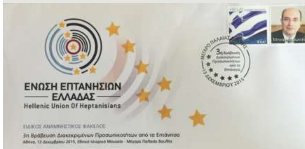
Copy of Invitation

Hoping for a the positive response to our invitation. Thank you in advance, and wish you every personal and professional success.