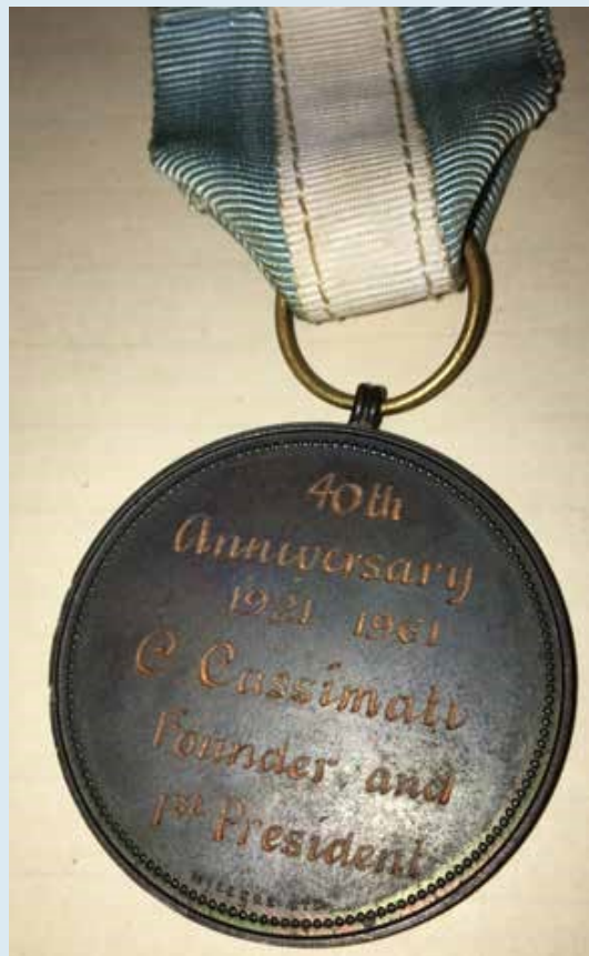
THE MEDAL DEDICATION TO COSMA CASSIMATI CELEBRATING THE ASSOCIATION’S 40TH ANNIVERSARY IN 1961